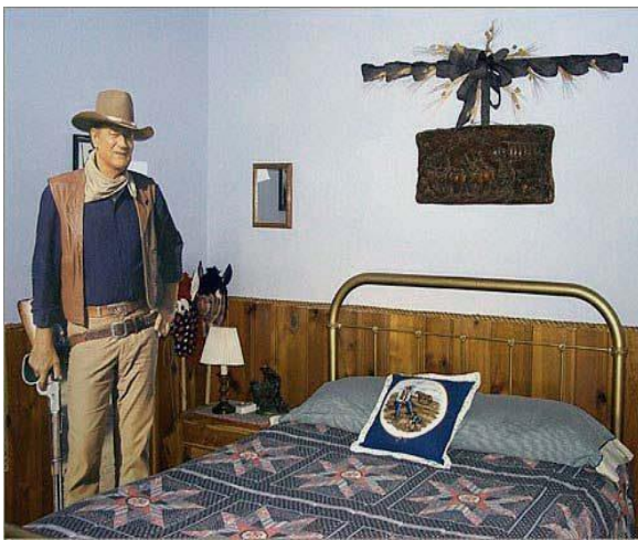
John Wayne Room