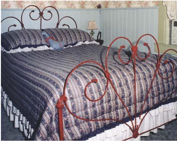
Birds Nest Room